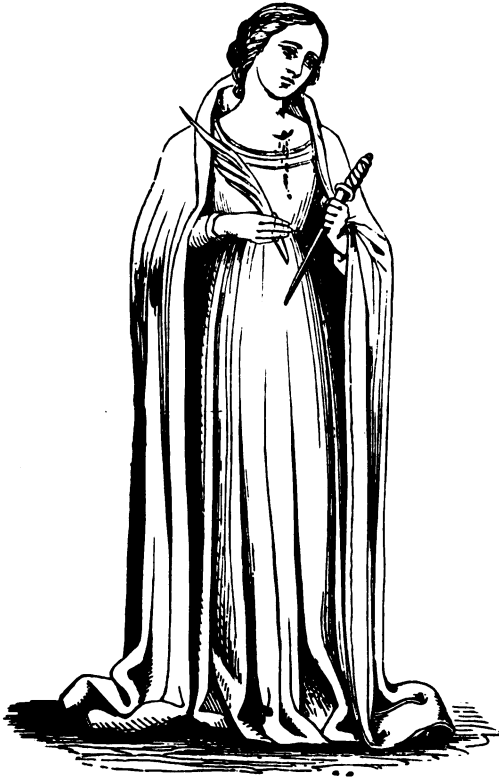
S. Lucia ( Angelico de Fiesole ).

S. Agatha, who, half a century before, had lived her holy life and died her holy death in this same island of Sicily,